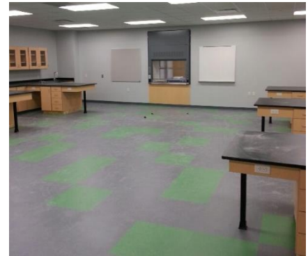
Second floor science classroom - Area A