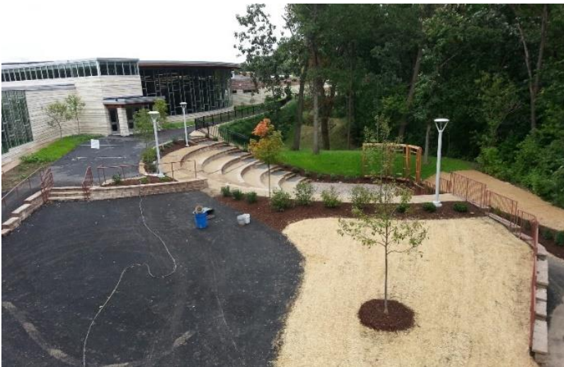
Safety railings and additional seeding around the amphitheater has been installed - Site