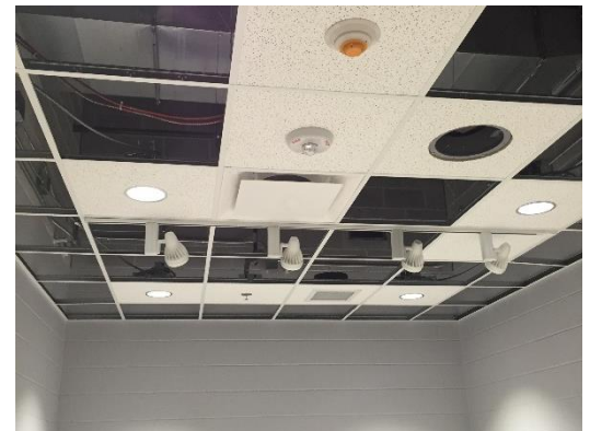
Ceiling tiles are being put in at select areas!