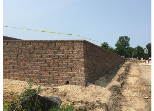
Block retaining walls have been installed!