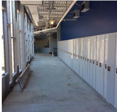
Painting and locker installation is ongoing in the west portion of the 6 th , 7 th and 8 th grade wing – Area A