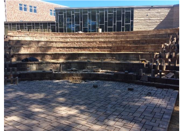
Amphitheater seat walls are in place and pavers are being installed - Site