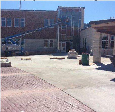
Stamped concrete is in place at the main entrance. 5 th grade fire rated curtain walls have been framed - Site