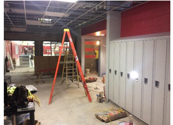
Painting, locker installation, and bathroom wall tile installation is complete in the 5 th grade bathroom area. Work is ongoing in the existing gymnasium – Area D