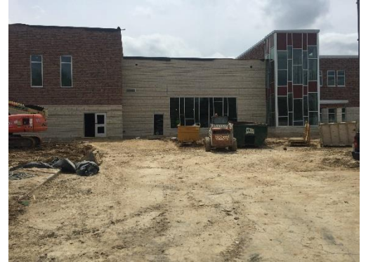
Exterior glazing and doors installed in phase III.