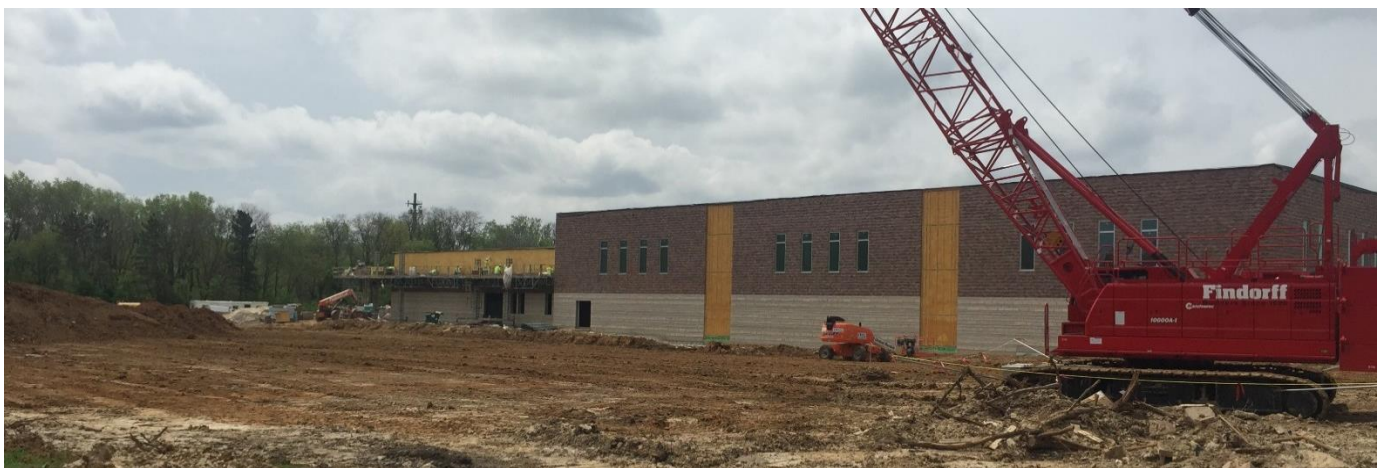
Exterior masonry is progressing around the gym. While the field is being graded in the forefront of the picture