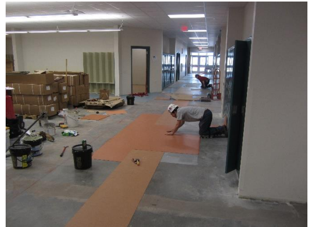
Install Vinyl Flooring – Area G