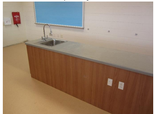
Casework, Countertops, Plumbing Fixtures and Marker Boards – Area G