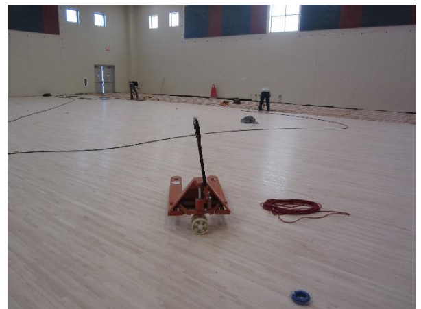
Install Gymnasium Flooring – Area F