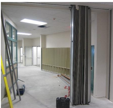
Install Accordion Doors – Area G