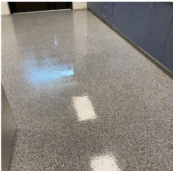
Epoxy flooring completed in the new receiving room.