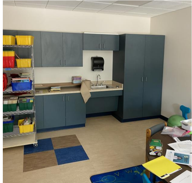
Wall-hanging cabinets hung in the new classroom.