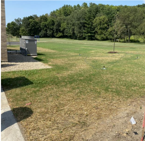
Seeding has been completed around the addition.