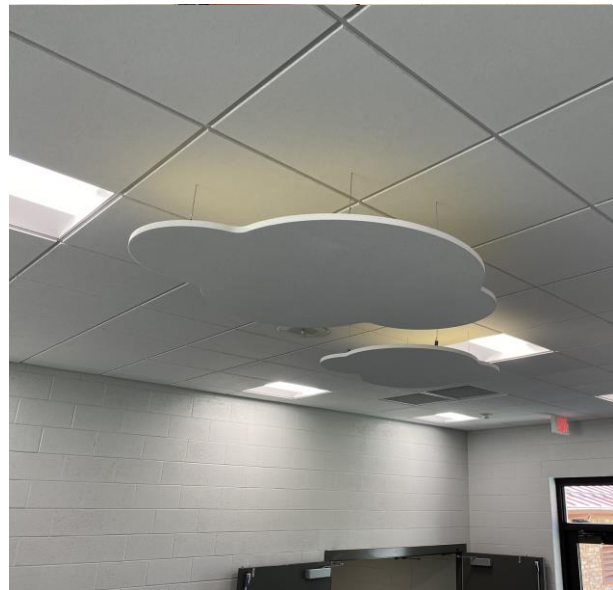
Hanging cloud decorations in the cafeteria vestibule.