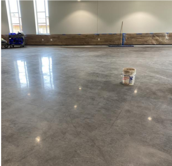
The concrete in the cafeteria was polished.