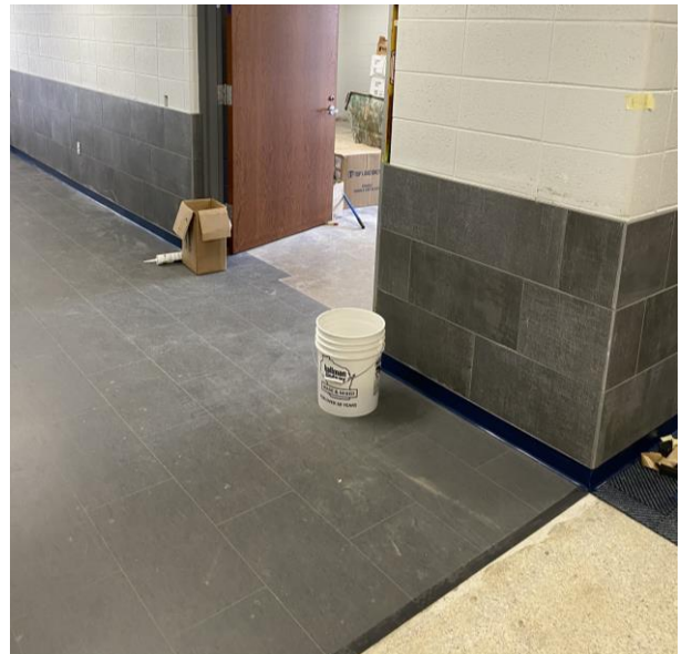
Wall tiling and floor tiling have been installed in the hallway outside of the new receiving room.