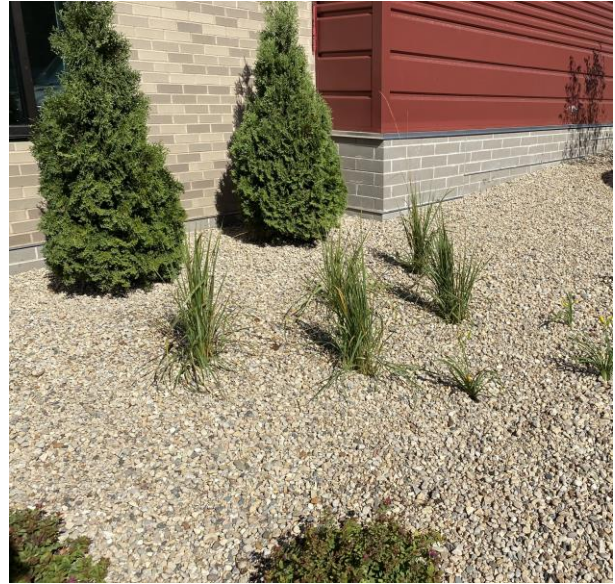
Landscaping added around the exterior of the addition.