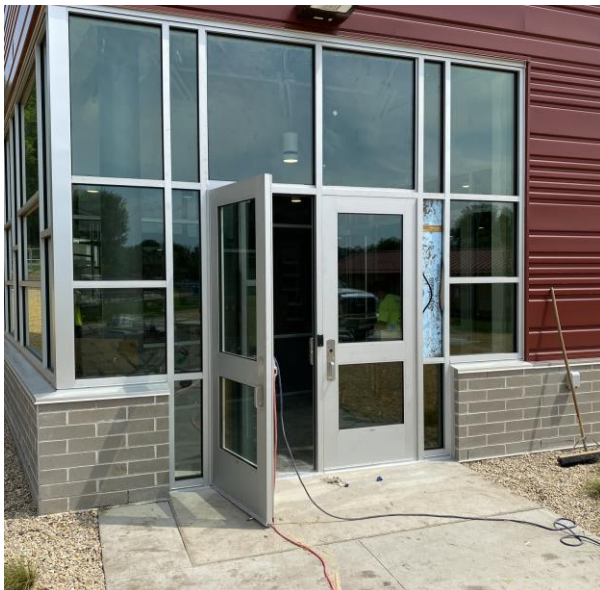
Doors and windows installed in cafeteria vestibule.