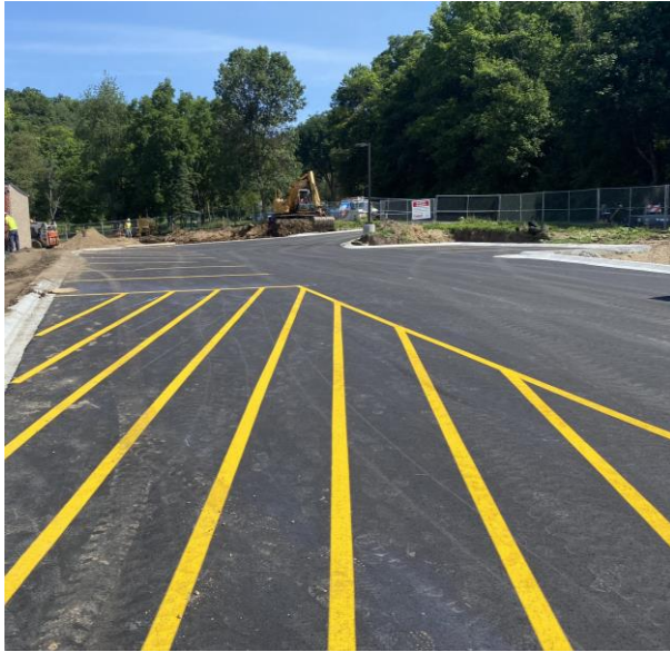
Final course of asphalt laid and striped in new parking lot and basketball courts.