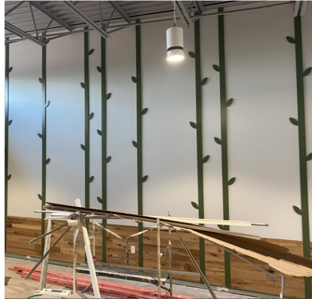
Leaves and stems added to walls in cafeteria along with wooden wall finish along the bottom.