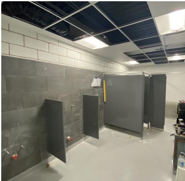
Wall tiling and bathroom partitions in the new bathrooms in the cafeteria addition.