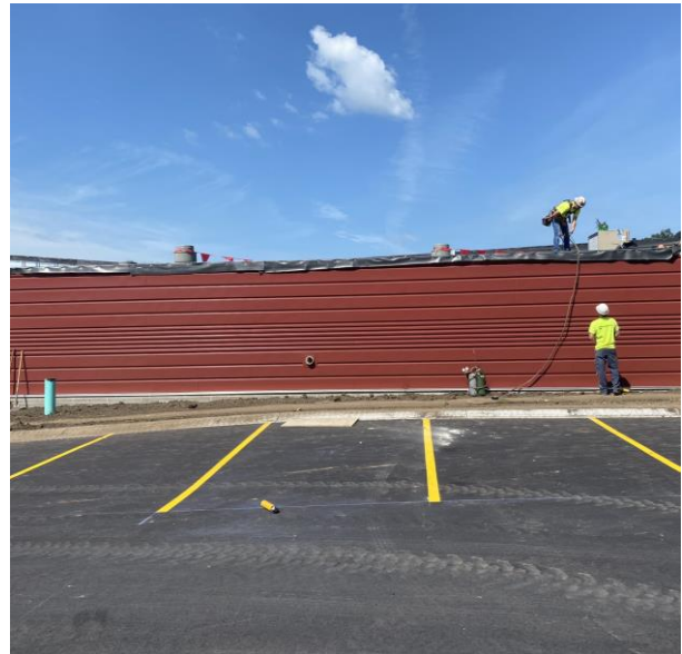
Metal panels hung on hat channel on the cafeteria addition.