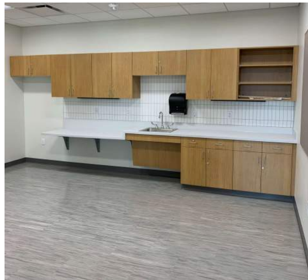
Vinyl flooring added in parts of the administrative area.