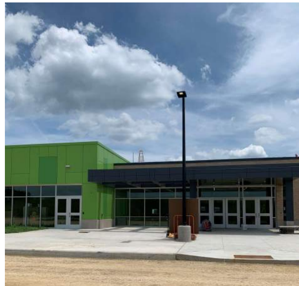
Entryway doors and frames installed on the west side of the building and the metal paneling has been completed on the canopy.