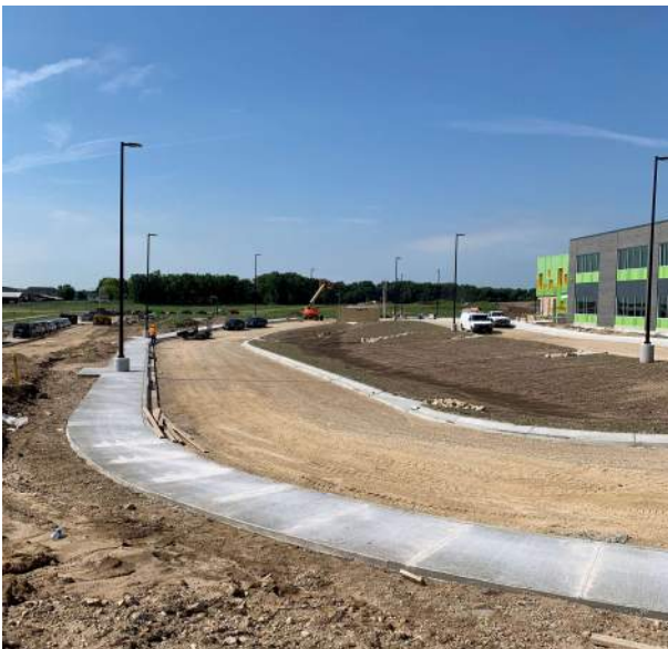
Curb, gutter, and sidewalk poured around the parent drop-off loop.