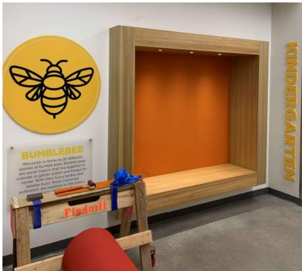
Kindergarten and bumblebee signs added next to the display case.