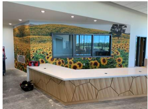
Sunflower graphic added behind the LMC reception desk.