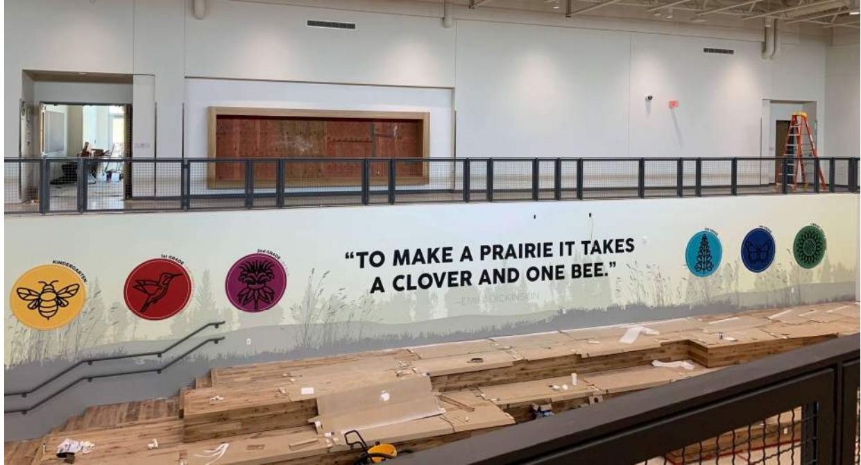
Graphic added above the social stairs in the atrium area.