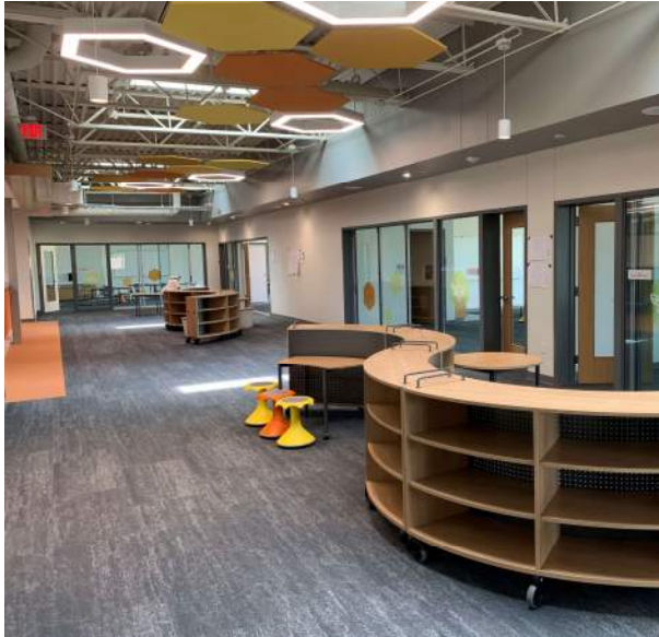
Cloud ceiling and hexagon lights added to the Kindergarten common area.