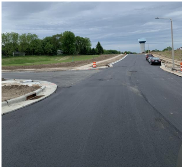
Binder course asphalt has been poured over the Schewe Road addition.