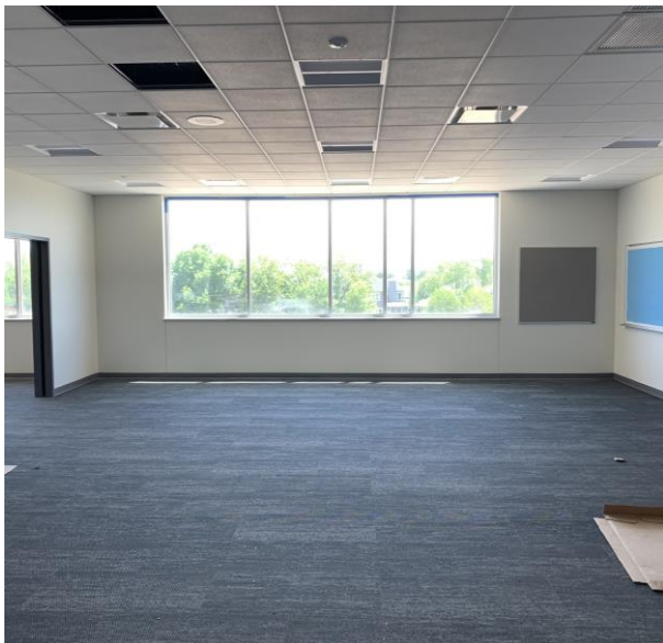
First grade classroom with carpet tile on the floor.