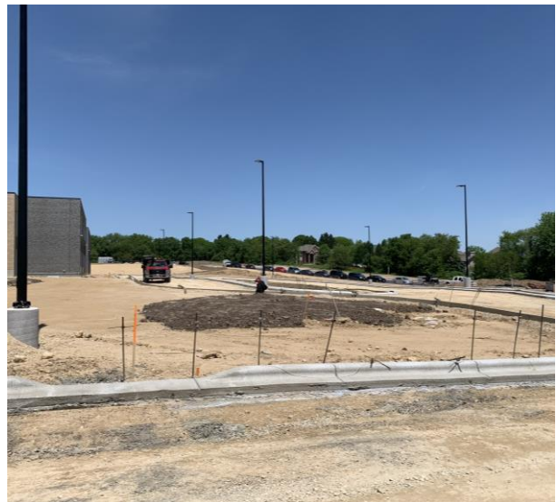
The curb and gutter has been poured over much of the school lot and light poles have been erected.