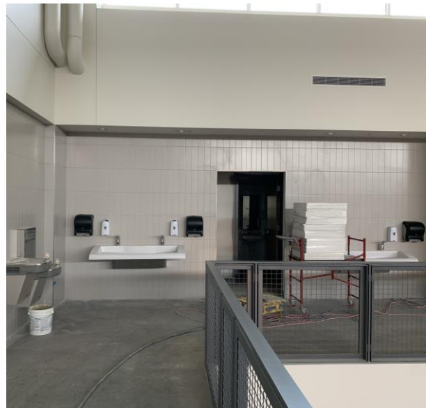
Water fountains and hand washing sinks outside of the bathroom in the second floor atrium.