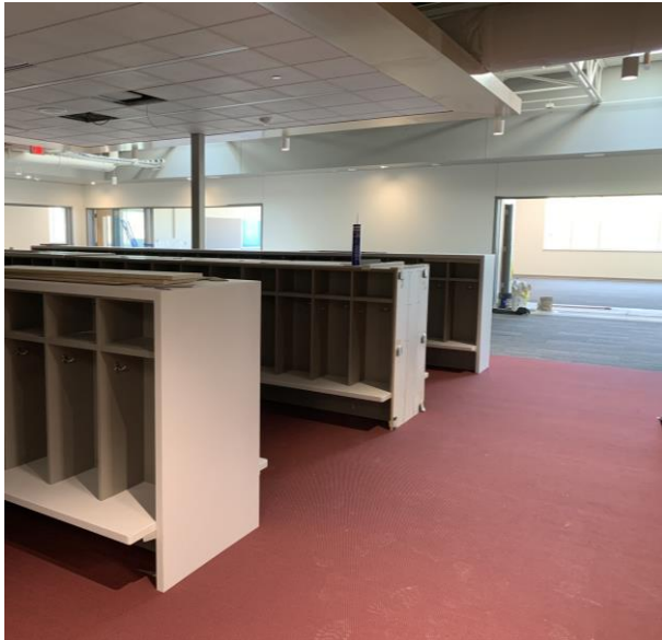
Carpeting has been placed in the kindergarten common area.