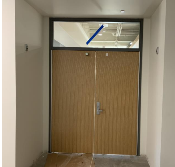
Interior swinging doors and borrowed lite glass added to an interior frame.