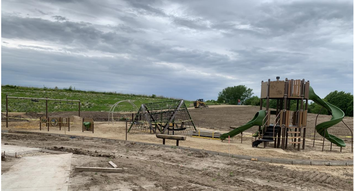
More equipment has been added to the playground.