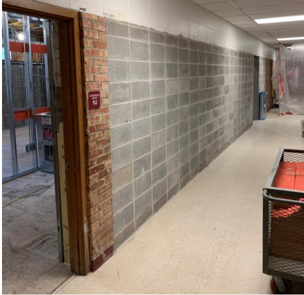
Interior CMU wall set in front of the new office and conference room spaces.