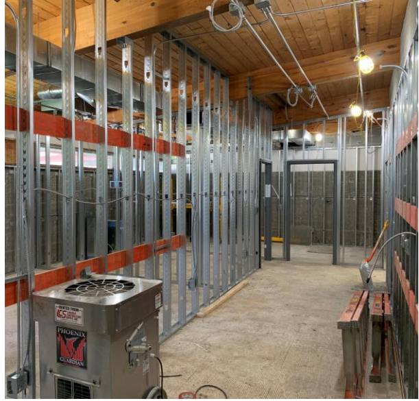
Blocking and electrical piping place inside of the stud framing for the new offices and conference room.