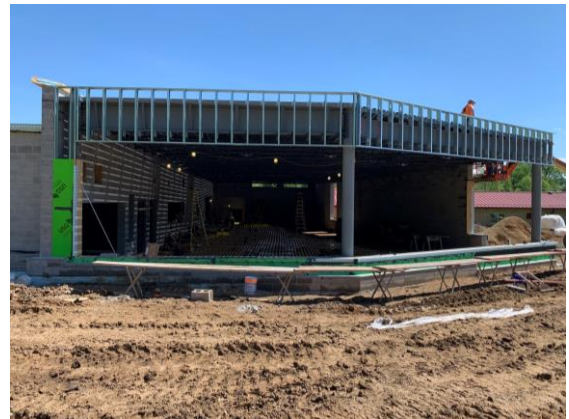
Exterior studs set on the north end of the building. Metal decking has been placed above the cafeteria on the steel trusses.