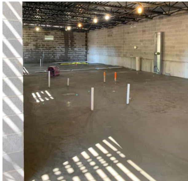
Slab-on-grade placed in the new kitchen and bathroom areas.