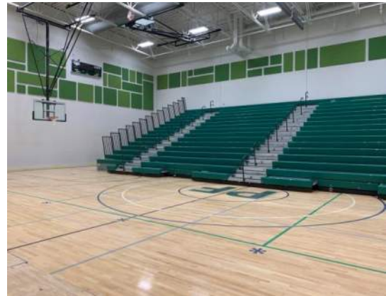
The bleachers installed on the north wall of the gym.