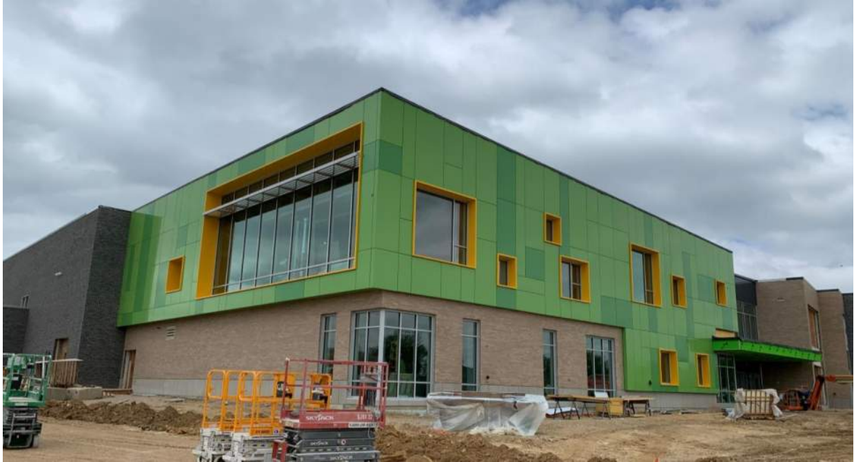
Southeast metal panels installed on the face of the building.