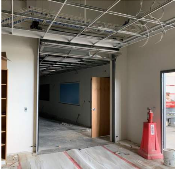
Overhead glass door and swinging wood door installed in the LMC area.