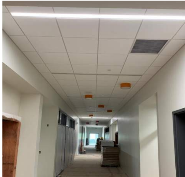
Ceiling tile and lights in the ceiling of the second floor corridor.