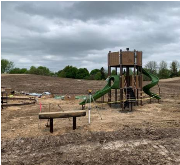
Playground equipment is being installed off the northwest corner of the building.