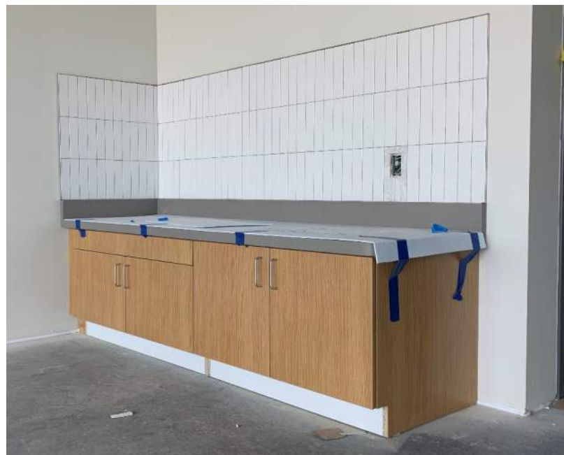
Above: A cabinet, countertop, and tile back splash all installed in a kindergarten classroom.

Site Drone Video: https://drive.google.com/open?id=1xhK_N5gB0NEV5dJN6nNQj3R_93FW48aR