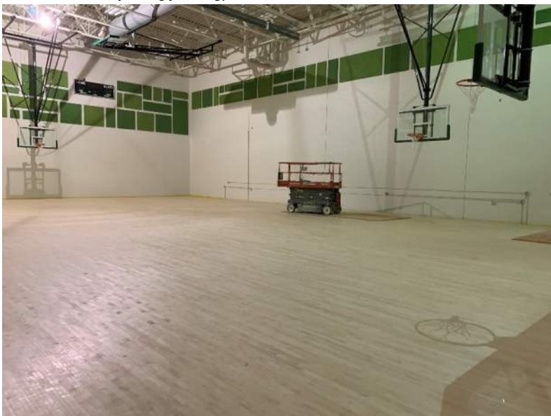
Below: The wood flooring for the gym has been laid..