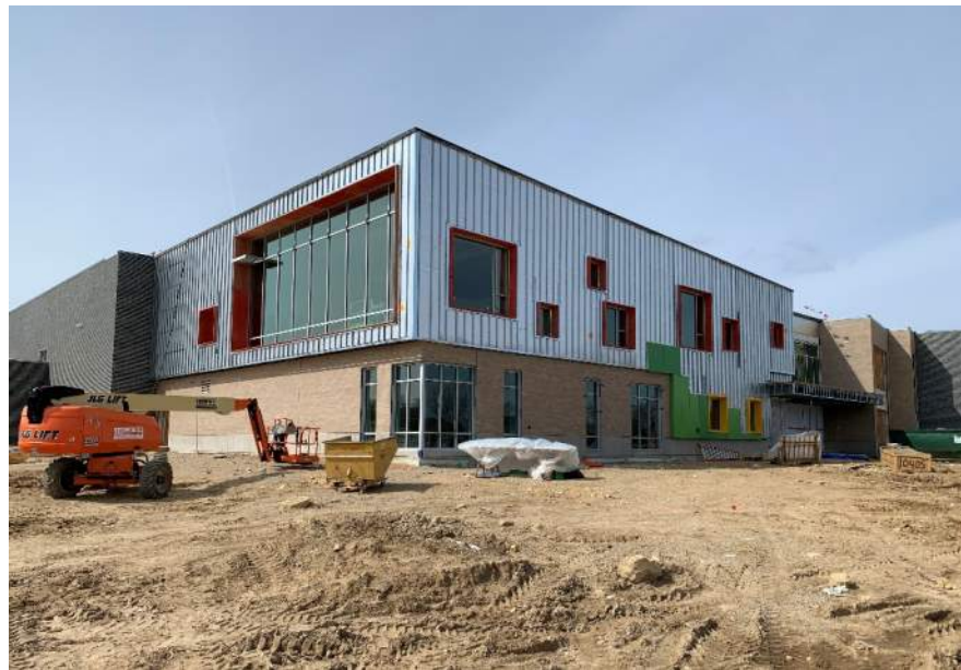
Above: The large LMC window has been installed. Large green metal panels added to the side of the building by the offices.