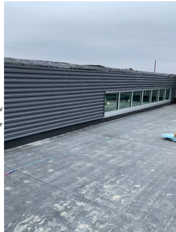
Right: Metal paneling added to the side of the clerestory roof.