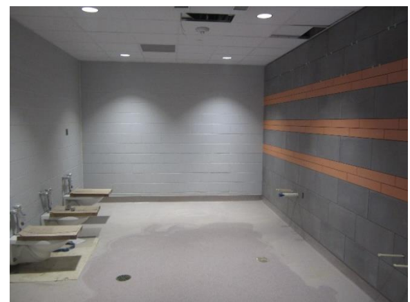
Plumbing fixtures and wall tile are being installed in the main bathrooms – Area C