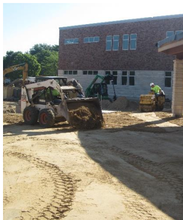
Grading at the front entrance is being completed in preparation for sidewalks. - Site