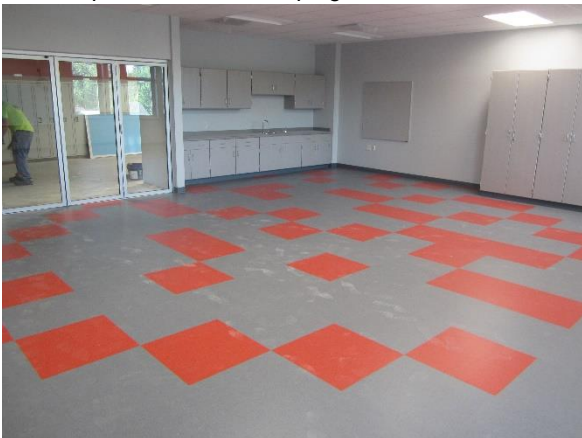
Vinyl floor tile is being installed in 5 th grade classrooms – Area D