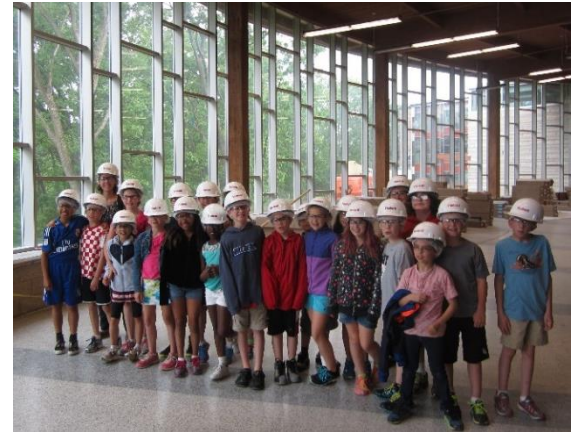
Future 5 th grade students from Elm Lawn, Northside and Sauk Trail visited Kromrey for tours of the 5 th grade wing