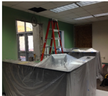
Front Office Window Installation – Area C