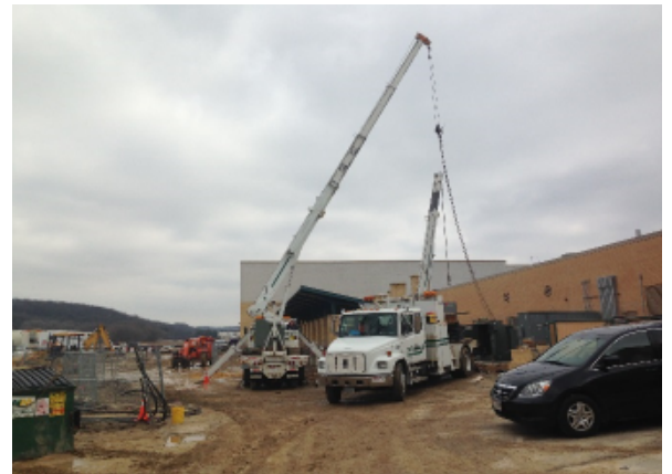
MG&E Electrical Service Upgrade - Site