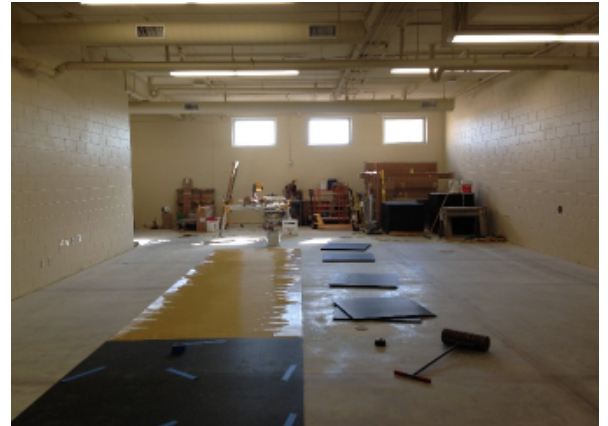
Install Athletic Flooring – Area F