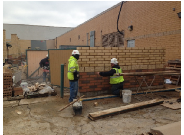
Re-Brick Trash Enclosure – Site