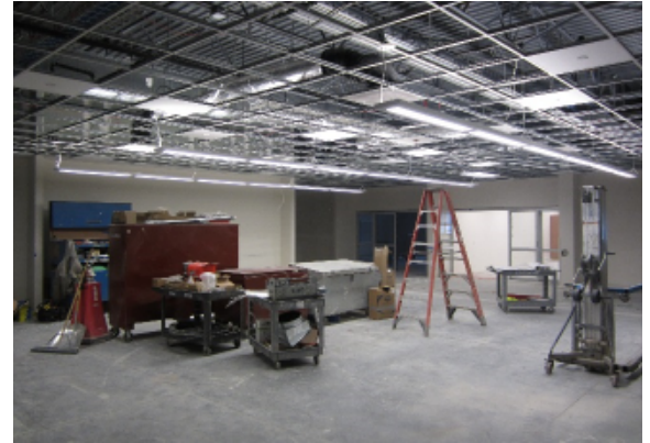
Install Lighting in Resource Center– Area G