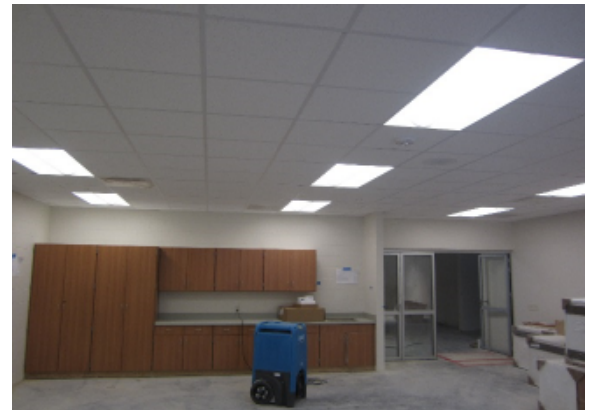
Finish Casework & Ceilings in Classrooms – Area G