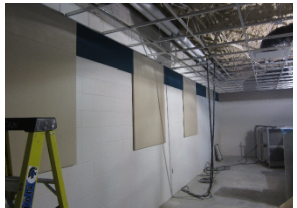
Acoustical Panels & Ceiling Grid in Music – Area D