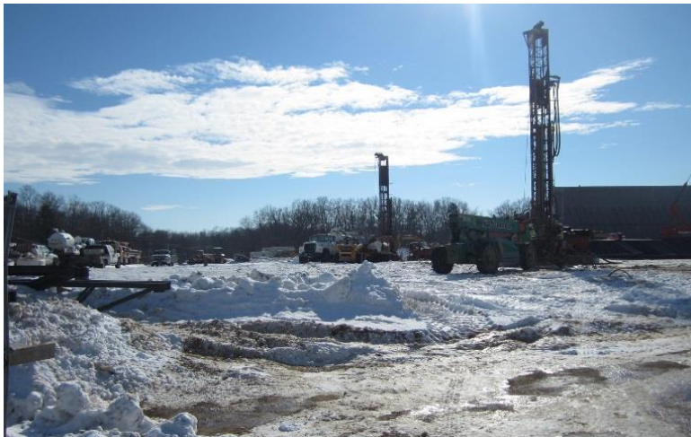
Geothermal well drilling in progress with both drill rigs running.