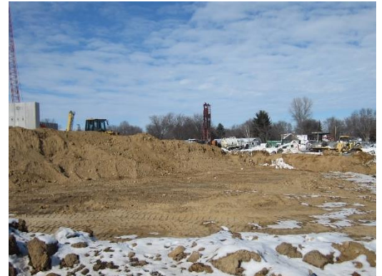
The site of old Kromrey Middle School with work going on in the background for the new school