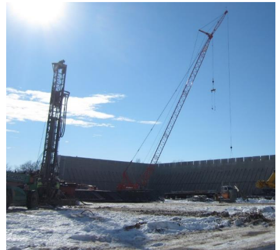
Precast wall panels are being placed.