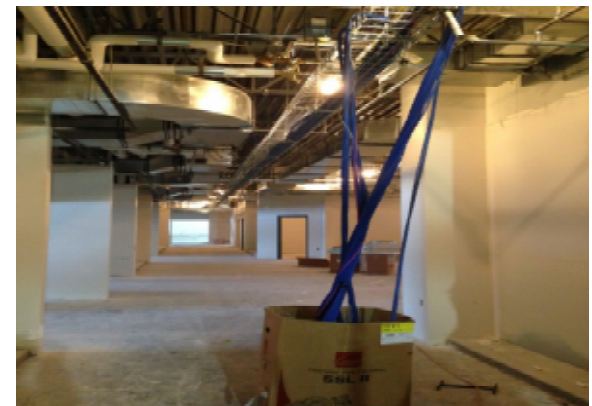
Pull Data Cabling in 5 th Grade Wing – Area G