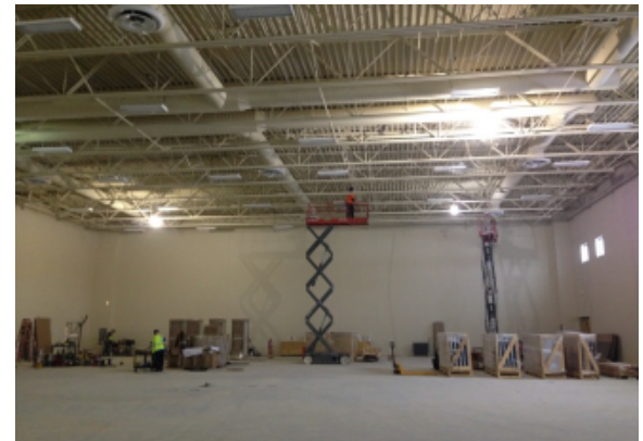
Install Gymnasium Light Fixtures – Area F