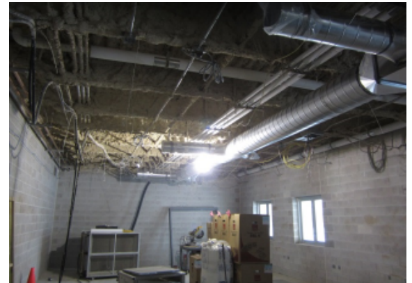
Music Room MEPF Rough – Area D